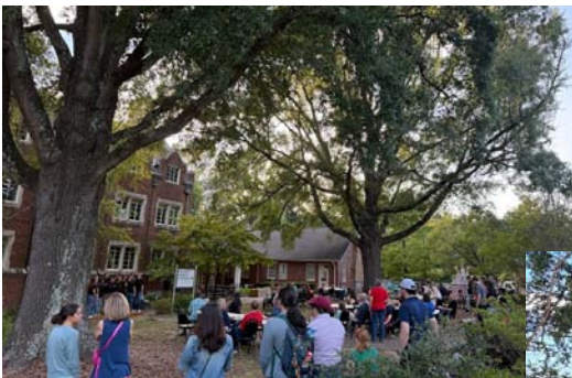
Food Truck Rodeo