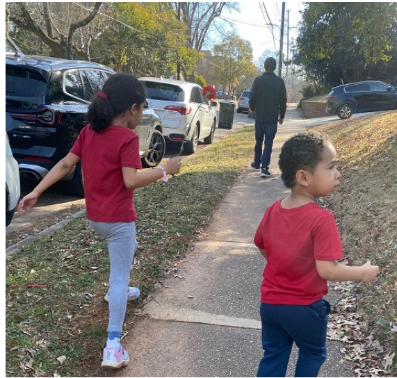
Handing Out Flowers on Valentine's Day