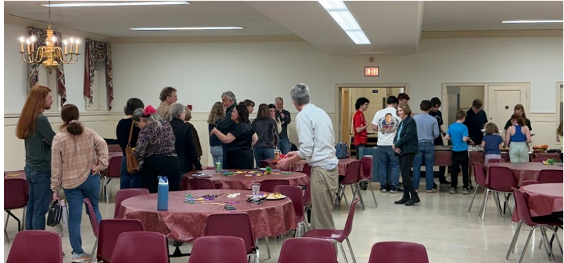
Breakfast for Supper and Ash Wednesday Worship