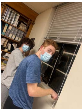
Wesley Students at Work in the Church Library