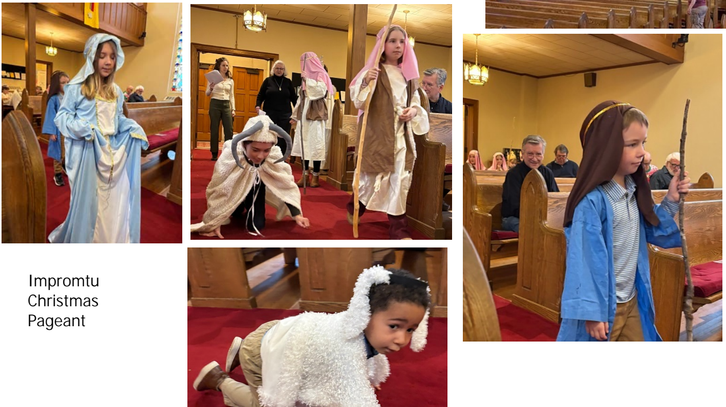
Impromptu Christmas Pageant