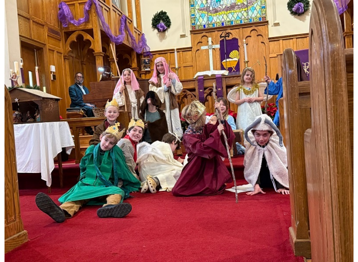
More Impromptu Christmas Pageant