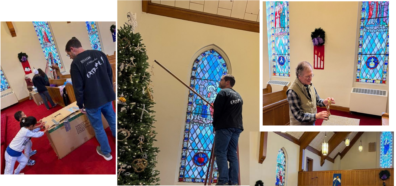
Decorating the Sanctuary for Christmas